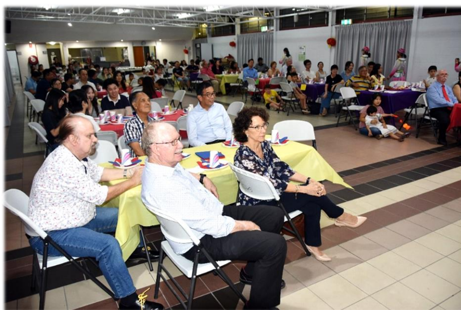
Guests in the 2021 Mid-autumn Festival Celebration