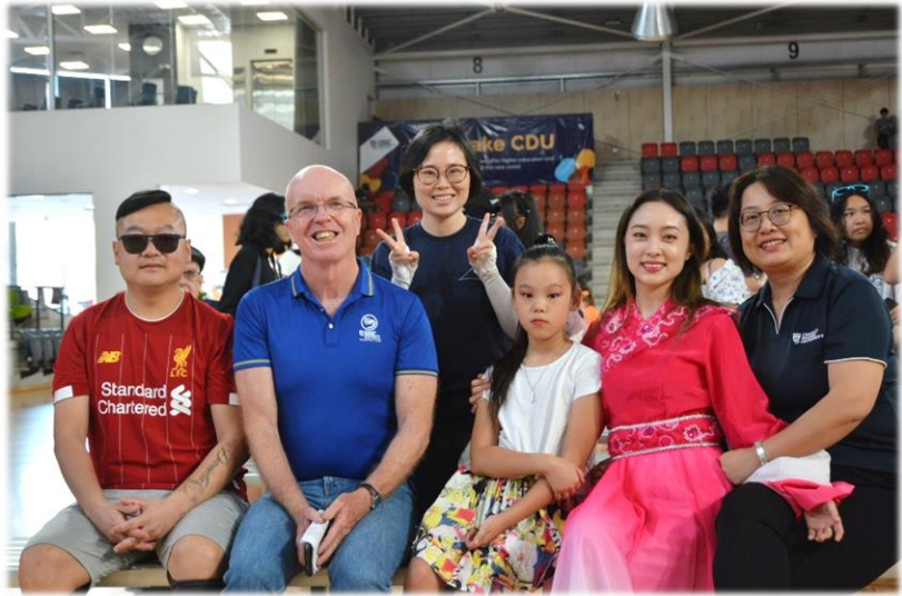
Teachers from CDU CI and guests