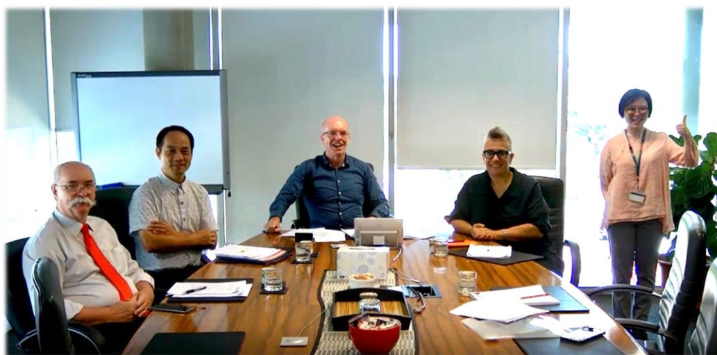
Attendees from CDU at the Board Meeting