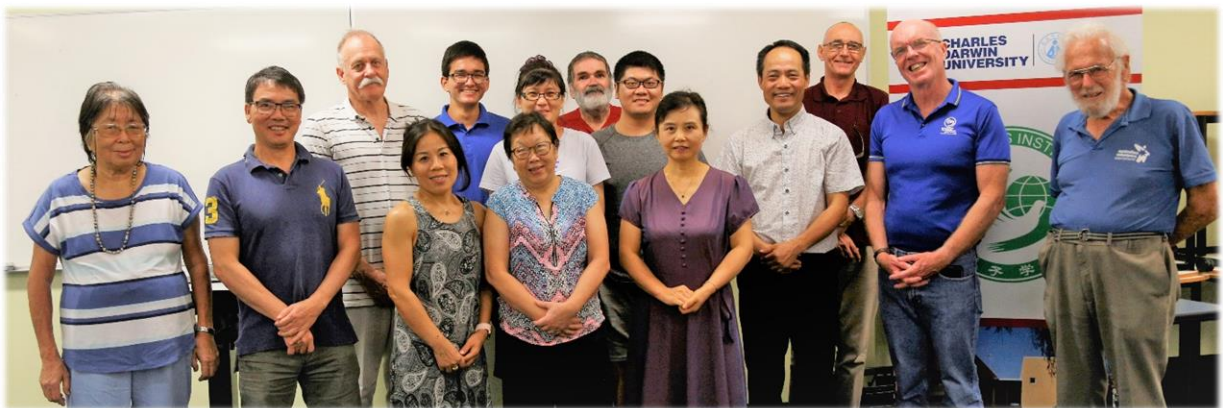
A group photo of guests and staff