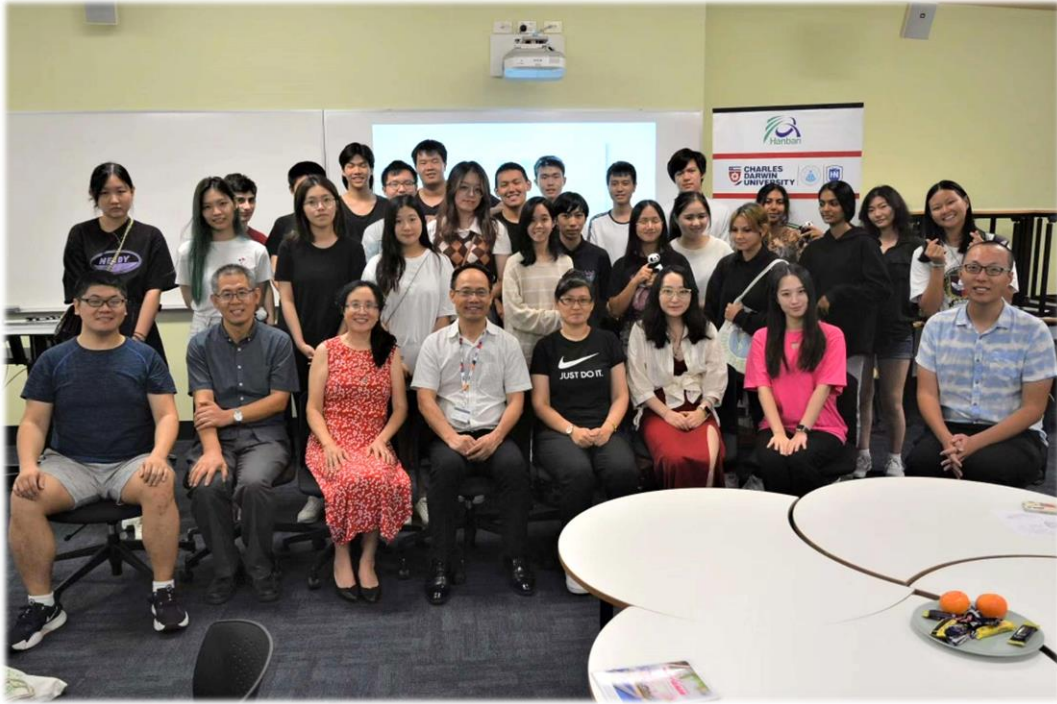
Teachers from CUD CI and guests from Darwin High School