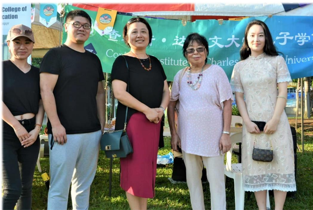
Teachers from CDU CI and guests