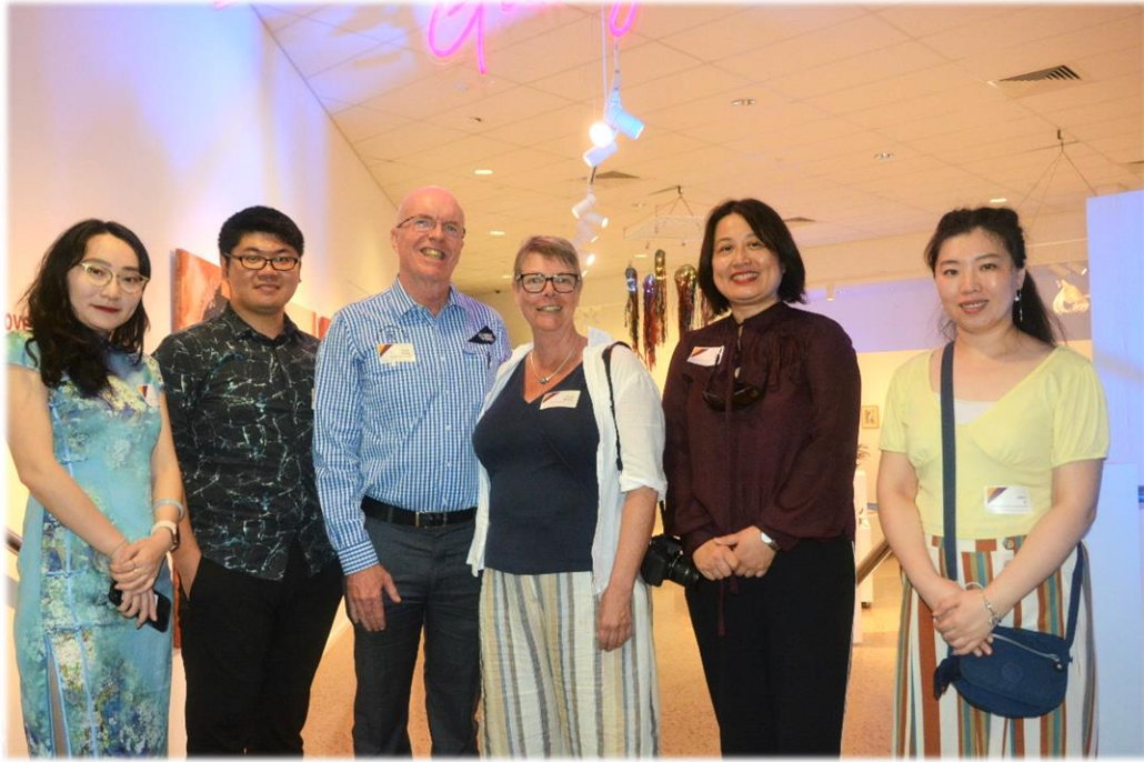
Teachers from CDU CI