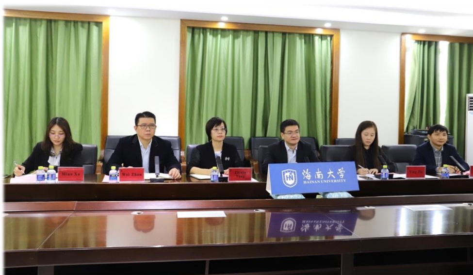
Attendees of Hainan University at the Board Meeting