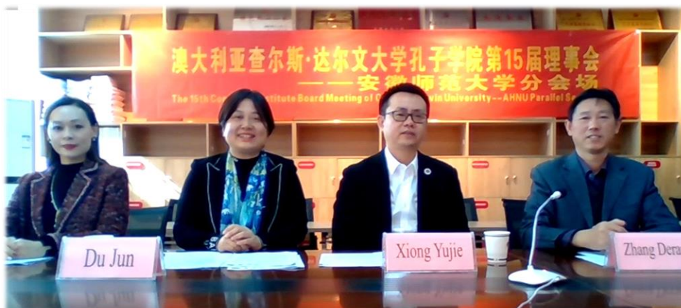
Attendees from Anhui Normal University at the Board Meeting