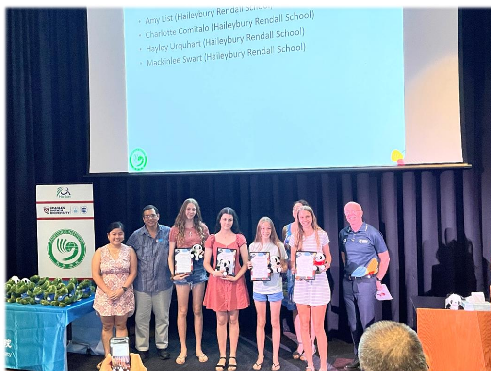
Winners at the Awards Night