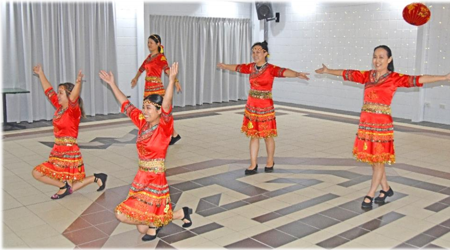
Members from Australia-China Friendship Society performing Chinese Dance