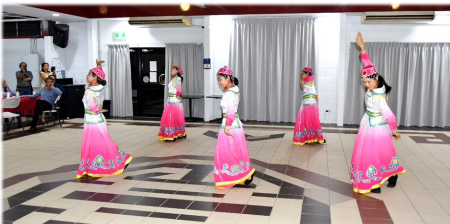
Members from Australia-China Friendship Society performing Chinese Dance