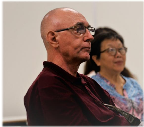
Guests were attracted by the Professor's compelling journey